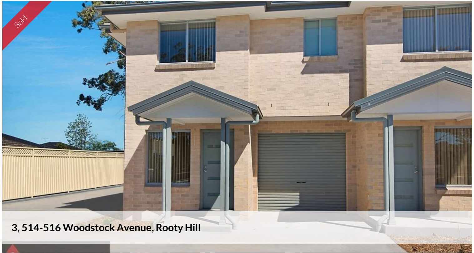
3, 514-516 Woodstock Avenue, Rooty Hill