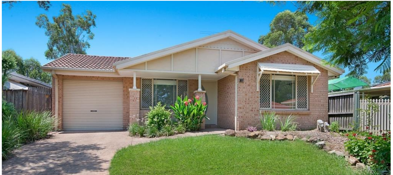
31 Yatay Pl, Plumpton